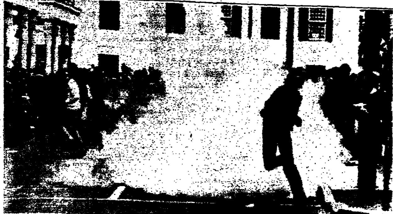
A demonstrator in Cape Town hurls a teargas canister back at police during a demonstration on Monday protesting police violence against student demonstrators.